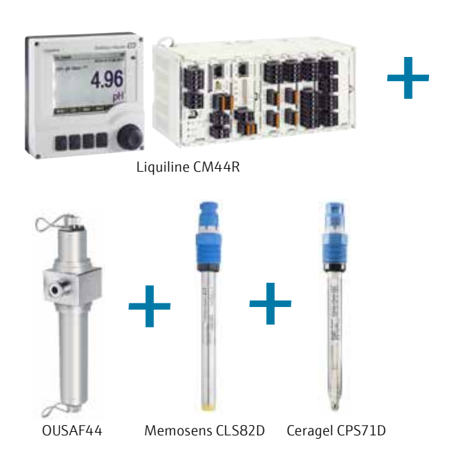
The perfect combination for monitoring chromatography

Combine the OUSAF22 process photometer with conductivity measurement. The OUSAF22 detects the spectrum of colors e.g. of different beers and, in conjunction with conductivity measurement, allows you to make an accurate distinction between different drinks so that errors are eliminated during the filling stage.