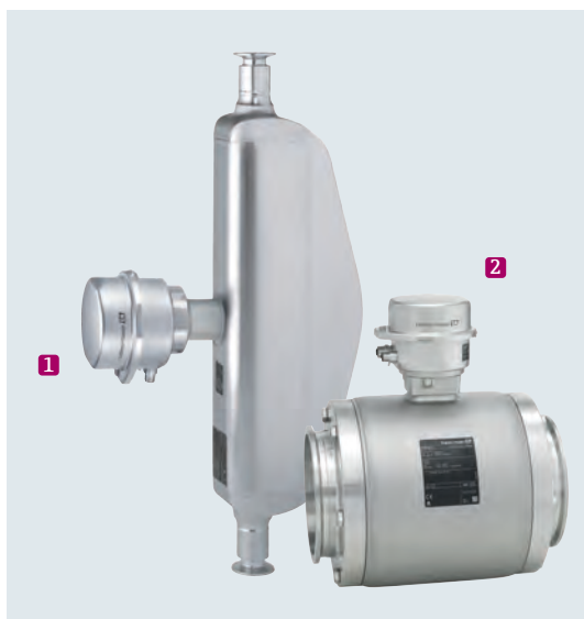
1 Promass P 100 2 Promag H 100